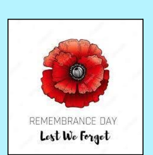
November 10, 2023